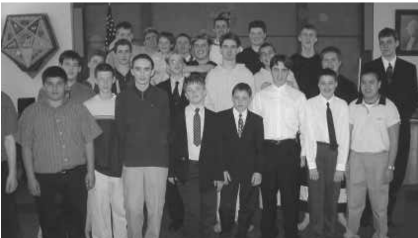
Oregon DeMolay welcomes new members to Eugene, Sellwood, Beaverton, Pacific, Mt. Hood and Tigard-Orenomah Chapters at the March 2, 2002 DJR Class in Eugene, Oregon.

To reach or submit articles to the Oregon DeMolay Newsletter, you can reach the Oregon State Council at the address and phone number listed to the right.