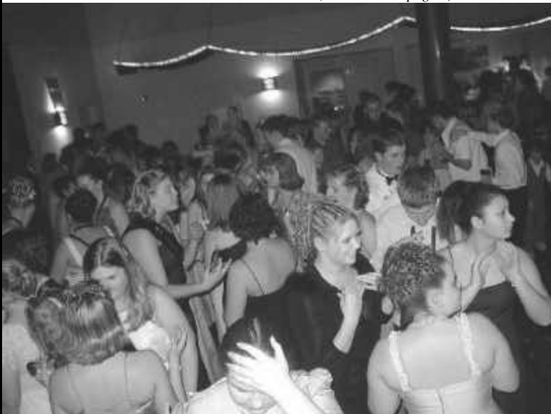
Everyone had a great time dancing the night away at the State Reception and Ball on February 16, 2002 held to honor Councilors and Sweethearts.