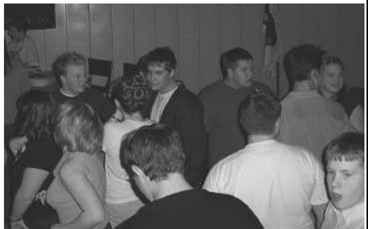
Everyone having a good time dancing after Chemeketa's installation on January 26, 2002, in Salem, Oregon.