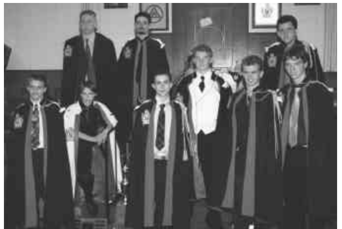
Beaverton always has time to pose for a group photo.

Want us to talk about your installation in the next ODN? Have a great installation photo to share with Oregon DeMolay? Send it to Cactusjack385@yahoo.com and we'll be sure to add it in the next issue!!